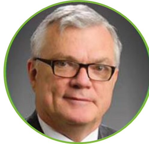
Pr. E Quigley (USA – Houston)