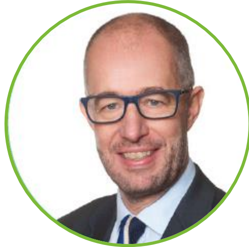
Pr. M Simrén (Sweden – Goteborg)